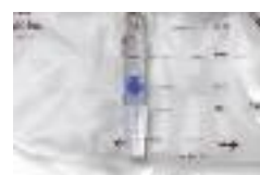
Modell B 1000 P