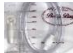
Modell B 1000 CT

Considerable improvement of mobility and thus of the patient's quality of life – discreet and simple to hide under your clothes. No change from leg to bedside bag necessary any more. Reduced risk of unintentional catheter extraction, as there is no drainage tube. Necrosis of the urethra, as caused with men by hanging urine bags, is avoided with the Belly Bag®.